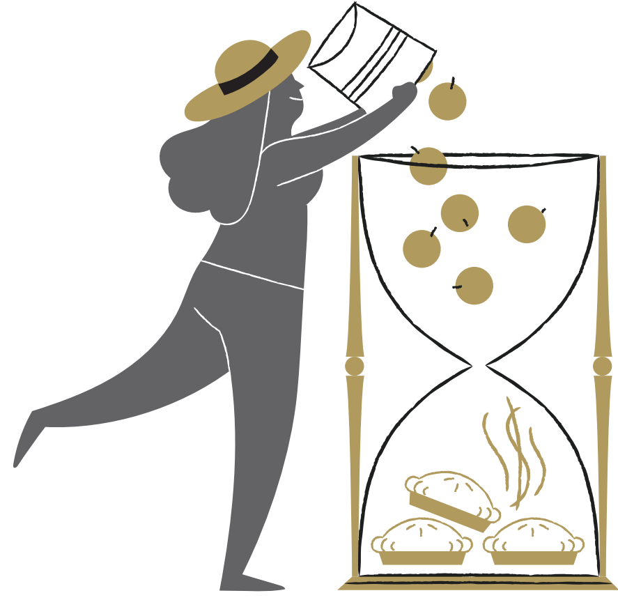
Page 1 of 4—Only valid with all pages.

If your non-qualified annuity increased in value, there's a tax-efficient way to use annuity payments: Purchase two life insurance contracts. One is a traditional life insurance contract to benefit your family. The other is a contract gifted to a donor-advised fund at Thrivent Charitable Impact & Investing® (Thrivent Charitable) to benefit the causes and charities you cherish.